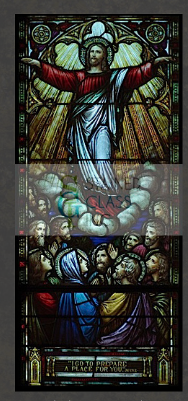
Stained Glass Inc. Panel 5724: Jesus Ascending

After He came back to life, Jesus remained on earth for 40 more days, continuing to share His message of God's love. On the fortieth day Jesus was called back to heaven, ascending in His resurrected form to sit at the right hand of God and rule forever. The Ascension of Jesus was witnessed not just by a single individual but by 11 of His apostles. In the gospels, those who