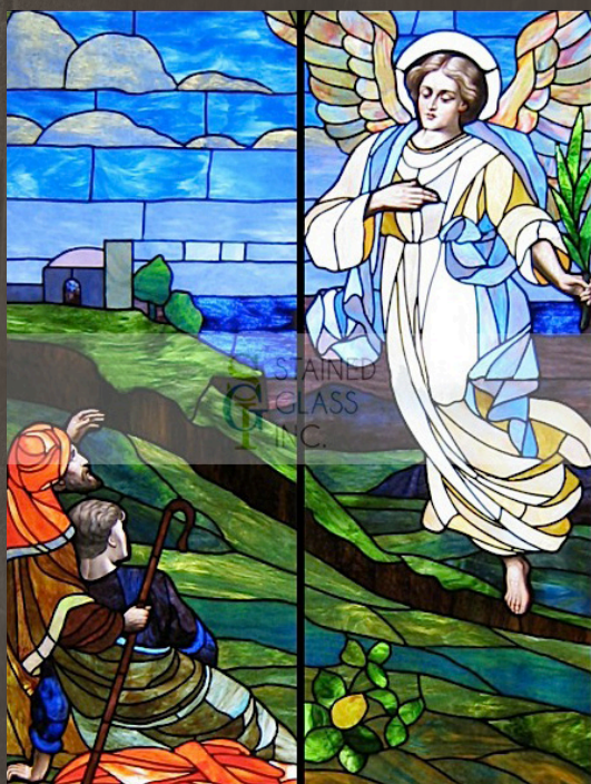
Stained Glass Window 5989: Assumption of Mary