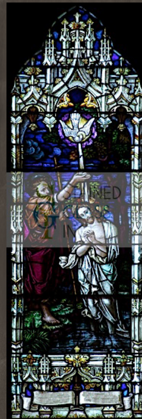
Stained Glass Inc. Panel 5198: John the Baptist

John the Baptist was a prophet of God who helped prepare the people for the coming of Jesus, urging them to be baptized so they could be cleansed of their sins. Jesus approached John the Baptist and asked the messenger to baptize Him, but John felt he was not worthy, saying Jesus should be the one to baptize him. After receiving words of reassurance from Jesus, John led Him into the river and performed the baptism.