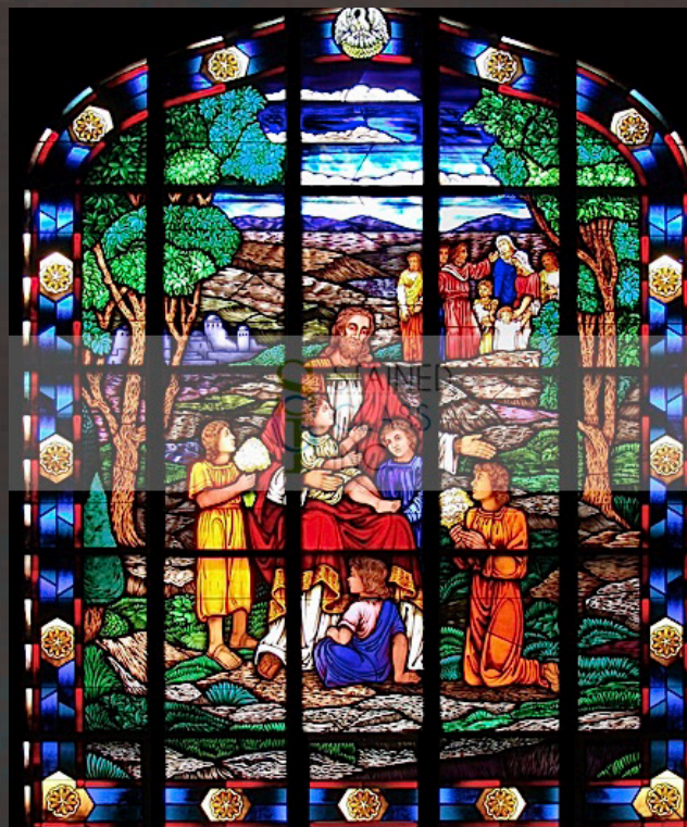
Stained Glass Window 5432: Children and Jesus

Christ's manner of welcoming the children He met into His arms and His heart is described in the Bible by both Luke and Matthew. In Luke 18: 15-17, the Apostle reveals that people with infants tried to present them to Jesus so that He might lay His hands on the newborns and bless them. This action made the disciples unhappy; they told the people not to allow their children to approach Jesus. The Messiah told the disciples not to send the children away, saying "let the little children come to me." He also told the crowd that we