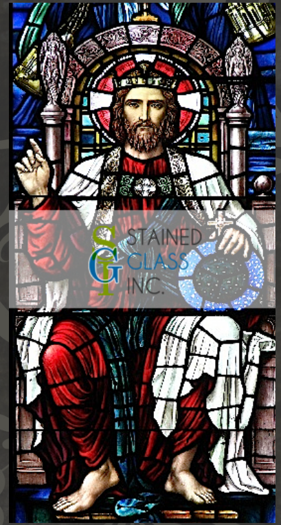
Stained Glass Window 209: The Lord Enthroned

Catholics and many Protestants celebrate the Feast of Christ the King at the end of the liturgical year. The title routinely given to Jesus is also found in the name of many parishes, so art glass windows depicting Christ as king can offer a way to pay homage to the word of the Lord while celebrating the unique identity of a place of worship.