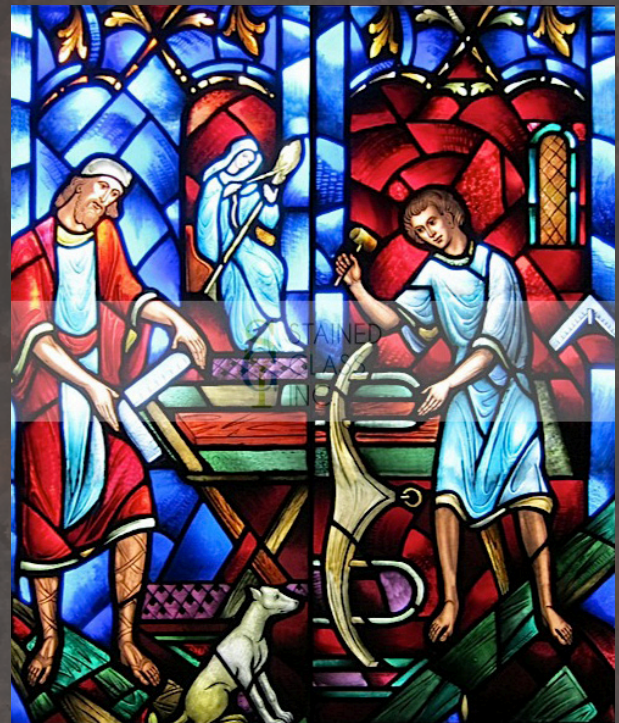
Stained Glass Window 378: Carpenter

The first account of Christ's youth is of course the story of the Nativity. When Joseph and Mary arrived in Bethlehem and discovered the inns were full, they were forced to take refuge in a stable. It was here in this humble setting that Mary gave birth to the baby Jesus. Shepherds in the area and the Three Magi were informed of His miraculous birth, and went to worship the Christ child. King Herod grew jealous of the infant when the Wise Men called Him "the king of the Jews." He ordered a massacre of all the young boys in Bethlehem, but the Holy Family