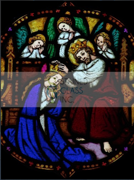
Stained Glass Window 6025: Crowning Mary

Mary's Coronation is a subject of many medieval stained glass windows as well as ones crafted in more modern times. The one characteristic the vast majority of these religious stained glass windows share is that it is Mary's earthly son Jesus Christ who places the crown on her head. In some cases all three members of the Holy Trinity are found in these stain glass works. God the Father is routinely depicted as an older gentleman, while the Holy Spirit is traditionally represented by a snow white dove. Early stained glass artists frequently depicted the setting of the Coronation as a court filled with the saints and angels, while later creations showed the mother of Christ and her heavenly companions in the clouds.