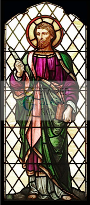
Stained Glass Window 6321: Evangelist