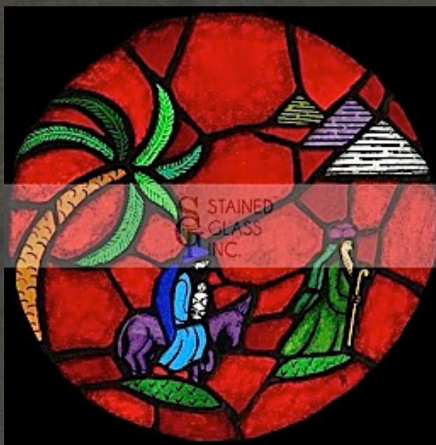
Stained Glass Window 5050: Primitive Flight to Egypt

The suffering of Jesus in the Garden of Gethsemane is described in the Gospels of Matthew, Mark, Luke, and John. After Jesus ate and drank in the company of the Apostles for the final time at the Last Supper, He went to the garden to pray. Three of His disciples—Peter, John, and James—were there with Him. The Savior knows of the sacrifice He is being asked to make, but prays to the Father to release Him from this