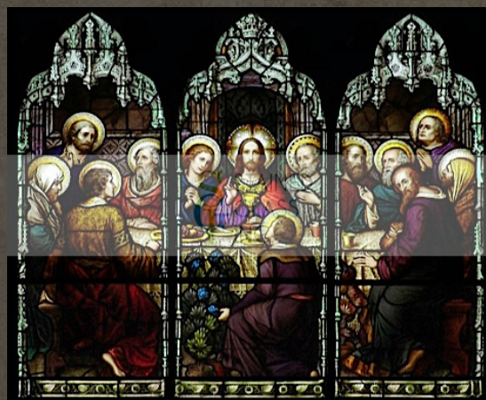
Stained Glass Window 5592: The Last Supper

Accounts of The Last Supper are found in the Gospels of Luke, Matthew, and Mark. This meal shared by Jesus with the Twelve Apostles is significant because it will be the final time these twelve pillars of the Christian faith and the Messiah will eat and drink together. Jesus knows what He is about to face, a fact that is evident in the words spoken by Him during The Last Supper. He tells the apostles that He will be betrayed by one among