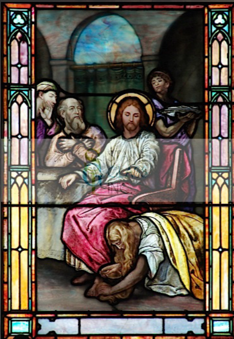
Stained Glass Window 6293: Costly Nard

Pictorial stained glass windows depicting Mary Magdalene tend to show her in the company of the Savior. Scenes that may serve as inspiration for stained glass artists include Mary anointing the Lord's feet, Mary discovering the empty tomb or encountering Jesus in His resurrected form, and Mary having her sins forgiven by Christ. Mary Magdalene is first mentioned in the Bible as a notorious sinner. After meeting Jesus she felt remorse for her actions, and when she asked for forgiveness Jesus did not hesitate to grant it. This regret earned her the title "Mary the Penitent." Ecclesiastic stained glass windows depicting Mary Magdalene can help illustrate for the faithful that Jesus grants us all the same forgiveness when we are repentant and sincerely intend to change our ways.