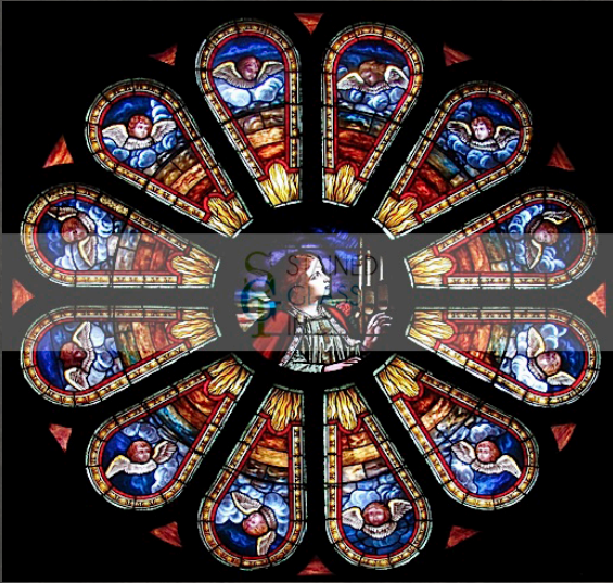
Stained Glass Window 6570: Rose Window

The sight and smell of a beautiful flower and the sweet sound of music is a combination that is truly a feast for the senses. Music rose windows combine both of these themes to create veritable masterpieces in faceted glass. They also feature all of the symbolism inherent in rose windows, including references to the Virgin Mary and the Twelve Apostles of Christ. Whether you are searching for Gothic stained glass windows for an extensive renovation project or just want one-of-a-kind stained glass inserts for the circular openings in your sanctuary, music rose windows will captivate the eyes and soothe the soul.