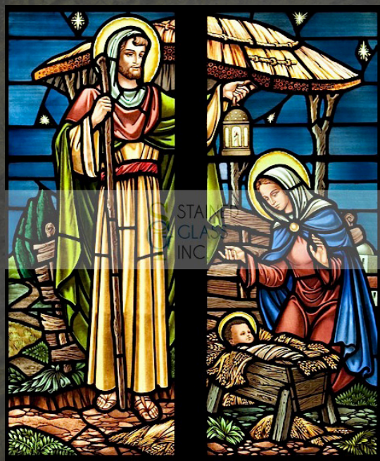
Stained Glass Window 503: Nativity

The Nativity is described in both the Gospel of Luke and the Gospel of Matthew. While Mary was with child, she and Joseph left Nazareth and traveled to Bethlehem. The reason given for this in the Bible is that they had to register for a census. When they arrived, they tried to locate a room at one of the inns in the area, but found that there were no accommodations available. Mary, then in the late stages of her pregnancy, and Joseph were offered shelter in a stable. It was in this humble setting that Mary gave birth to the baby Jesus. The new mother