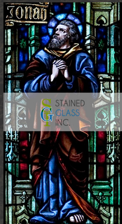
Stained Glass Window 61: Jonah