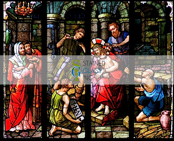
Stained Glass Window 145: Torture of Jesus

A parable is a story that is created to teach a fundamental lesson or reveal an important truth. During His time with mankind on Earth, Jesus frequently used parables as a teaching tool. Those who believe in the truth of the Bible tend to place special importance on these stories, as they represent messages that were delivered by Christ Himself. Since there are so many parables in the Bible this category of stained glass is a broad one. All church stained glass illustrating the parables of Jesus, however, are able to accomplish precisely the same thing as the stories told by the Savior Himself: make the fundamental lessons of Christianity easier to grasp by presenting them in an attractive and accessible manner.