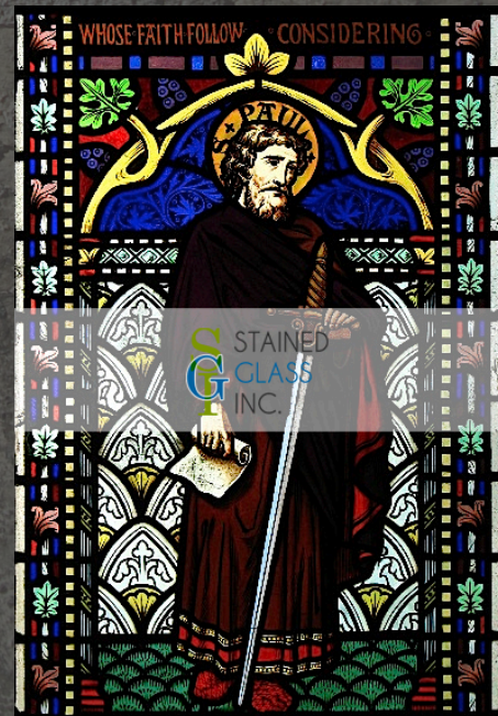
Stained Glass Window 223: St. Paul

Paul’s conversion on the road to Damascus is described in the Acts of the Apostles and by Paul himself in the First Epistle to the Corinthians. During Paul’s journey, a brilliant light from Heaven shone upon him. Jesus spoke to the soon-to-be Christian, revealing that He was the true risen Lord. Paul was