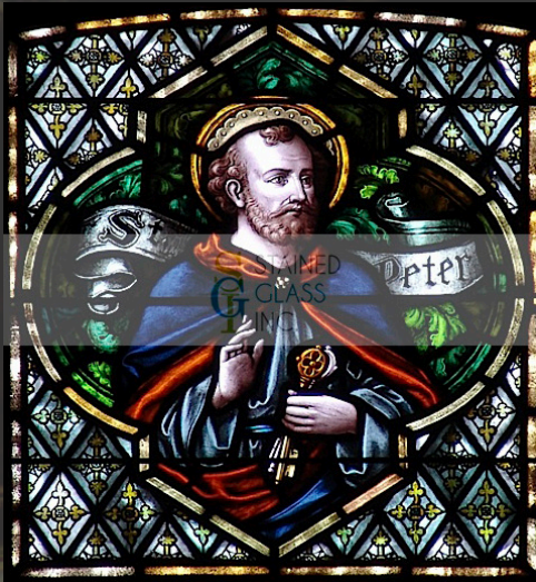
Stained Glass Window 6260: St. Peter