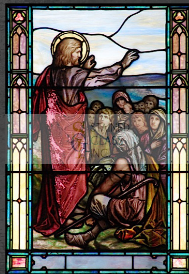
Stained Glass Window 5273: The Lord Teaching

Some of the issues Jesus addressed during His Sermon on the Mount were murder, divorce, adultery, taking oaths, giving to those in need, and the folly of standing in judgment of others. The Beatitudes