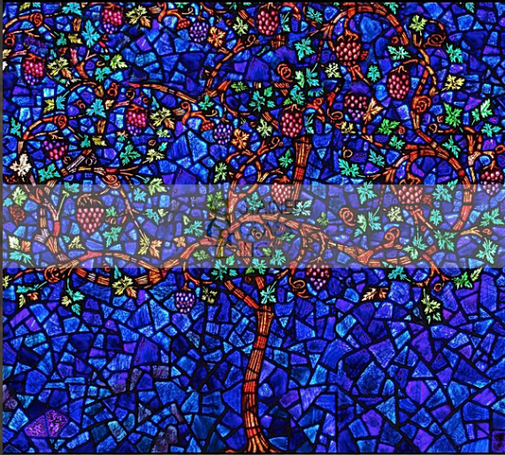
Stained Glass Window 451: Abide in the Vine

Symbolism is the representation of an idea or object through the use of something else. Writers and artists routinely employ symbolism in their works, and it is also an important aspect of the Christian religion. Some symbols are found in the Bible. Jesus Himself regularly used symbolism in His parables, and managed to make complex lessons and doctrines more relatable and easier to comprehend. Others symbols emerged some time after Christianity became a well-established religion. Regardless of their origins and histories of use, Christian symbols are excellent choices for church stained glass windows.