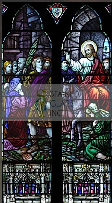
Stained Glass Window 5561: Riding Into Jerusalem